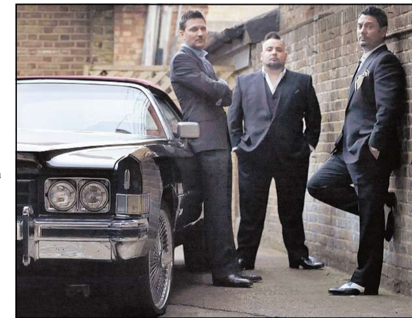
■ REVVED UP: Fun Lovin' Criminals are gearing up for a party in Holmfirth next month

But the one time US Marine is cagey about taking his TV career any further. "Everybody wants me to come by and say hi," he says. "Where I come from there really wasn't many opportunities. "So I'll try anything once and if I like it you'll see me there twice. "One thing I do enjoy is doing my radio show. That's one thing I keep on doing. "But I don't really think you're going to be seeing me on Get Me Out Of Here, Strictly Come Dancing on ice skates, or swapping wives, I've still got some integrity."